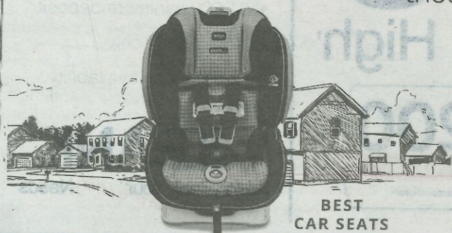
BEST CAR SEATS

We've researched, tested and analyzed thousands of items to make sure you get what's best.