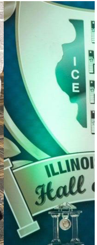
Sylvain Turcotte (Glenview)